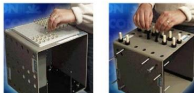
Hand and Finger Dexterity