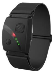
Wireless Heart Rate