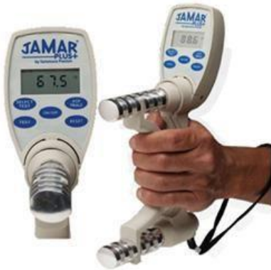
Wireless Isometric Grip