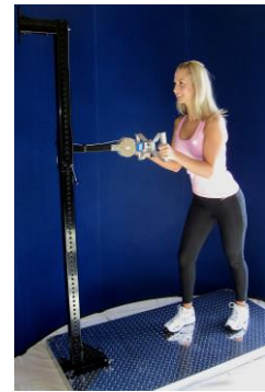
Arcon FCE System